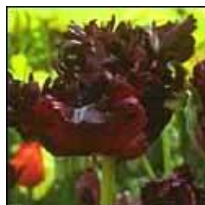
Figure 3: Black Parrot