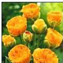
Figure 2: Beauty of Appeldoorn