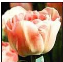
Figure 1: Angelique

Tulips are classified with perennials but often need to be treated as annuals. Dig up your tulip bulbs once the foliage has died & store them in a cool dry area for replanting in the fall. There are a wide variety of tulips, some are shown in the following figures.