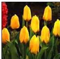
Figure 4: Candela