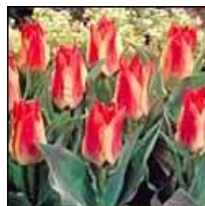
Figure 5: Plaisir